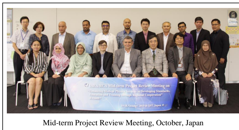
Mid-term Project Review Meeting, October, Japan

The mid-term project review meeting was also held in October in Japan. At the meeting, the reports presented by each participating GP showed medical physics training strengthened through the project.