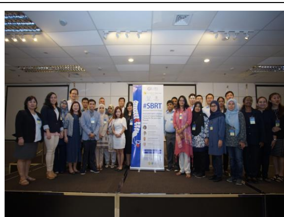
RTC on Stereotactic Body Radiation Therapy for Spine and Prostate Carcinomas, March, Philippines