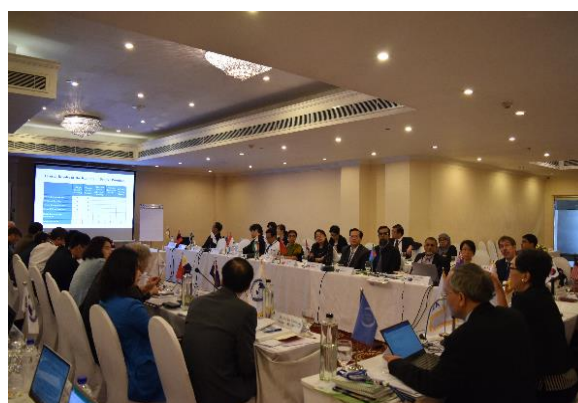
41 st Regional Meeting of National RCA Representatives, March, Sri Lanka