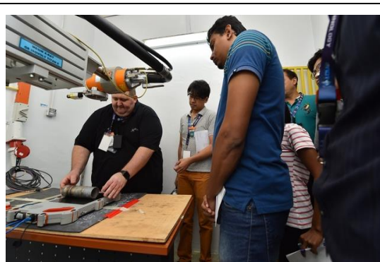
RTC on Radiographic Testing RT-D Level 2 for Personnel Certified to Radiographic Testing RT-F Level 2, June, Malaysia