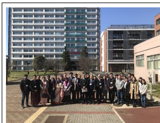
RTC on Isotopic Data Processing and Interpretation – Hands on Exercises, March, Japan

As the final activity of the project, the final project assessment meeting was held in September in Mongolia. The contributions that this project had made to the improvement of the water quality in the region, such as the development of isotope, hydrogeological, chemical database and groundwater model and their dissemination to the end-users; demarcation of deep ground water zones in good quality with high replenishment rate; and facilitation of collaboration among decision makers and stakeholders were highly appreciated.