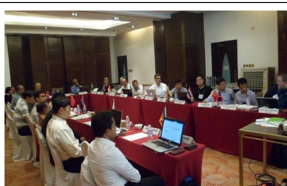
WS on NDT Examination Qualification and Certification Scheme Requirements in Accordance with the Latest Edition ISO 9712 and ISO17024, May, Philippines