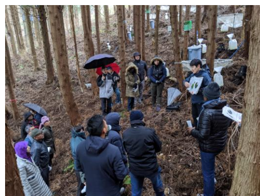
Mid-term Coordination Meeting, March, China