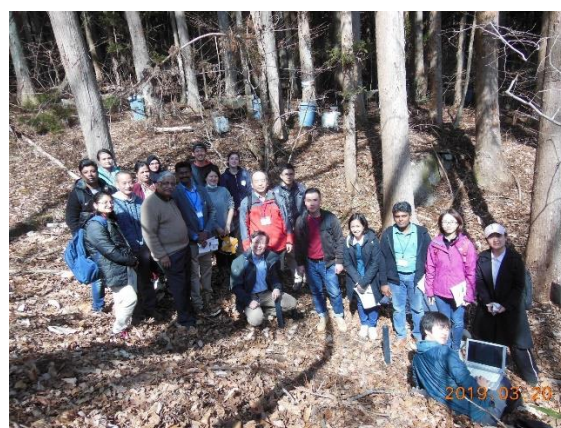
RTC on Isotopic Data Processing and Interpretation – Hands on Exercises, March, Japan