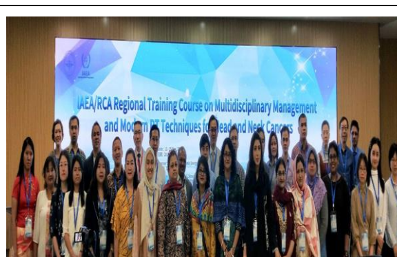
RTC on the Application of FRNs and Stable Isotopes for Soil Quality and Soil Erosion Investigation, August, Vietnam

In addition, national training courses were well conducted as planned in 10 GPs and trained more than 1,600 participants in advanced radiotherapy techniques for advanced cancer management.