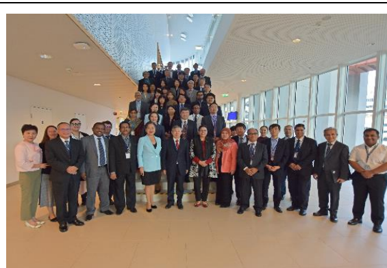
48 th RCA General Conference Meeting September, Austria

Meetings of the Working Group on RCA Medium-Term Strategy Coordination and RCA policy meetings were held as planned to decide on strategic and politic issues with regard to the effective implementation of the RCA programme.