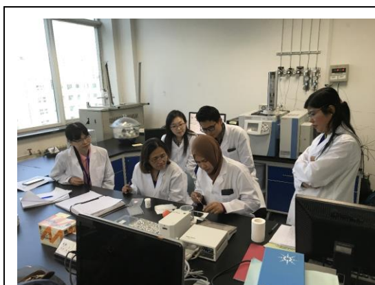
RTC on the Fundamentals of Using Nuclear Techniques for Verifying Food Authenticity (Part II), September, China

Finally, the mid-term project review meeting was held in November, hosted by the Institute of Nuclear Sciences and Technology in Vietnam. The implementation result and progress of the project were reviewed, and its plans were refined for the remainder of the programme. It was evaluated that the project has been well underway and produced significant amounts of meaningful data.