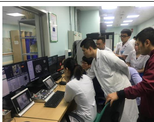
Expert Mission, December, Vietnam