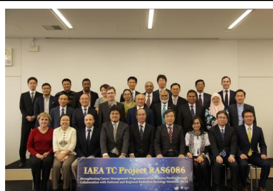
Mid-term Coordination Meeting, December, Japan