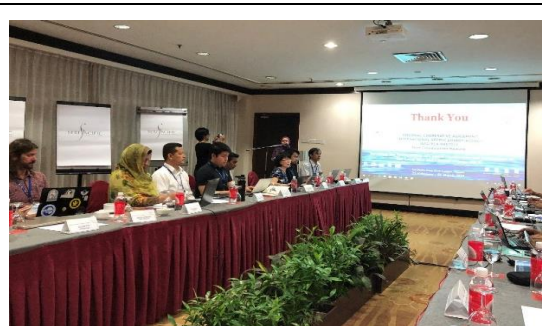
First Coordination Meeting, February, Malaysia

In addition, the first training course on the use of isotopic techniques in assessing coastal geomorphic change was conducted in December in Australia to provide training on sample preparation and basic sediment analysis, gamma spectrometry, laser particle size analysis and so on. The attendees from 11 GPs also experienced field activities at the Homebush Bay wetlands including measurements of substrate surface elevation change and sediment coring.