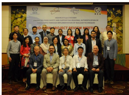
Mid-term Project Review Meeting, November, Vietnam