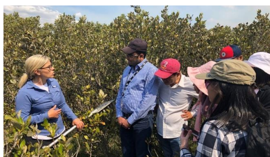
RTC on the Use of Isotopic Techniques in Assessing Coastal Geomorphic Change, December, Australia