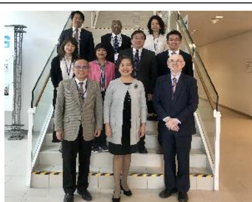
RCA PAC Meeting to Review "In-Kind" Contributions, May, Austria