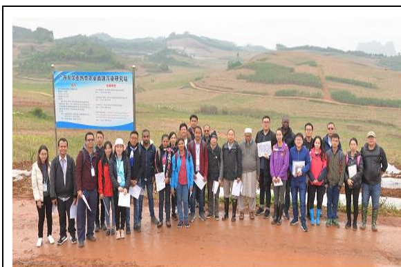
RTC on the Application of Stable Isotopes for Soil and Water Quality Investigations, March, China

Finally, the mid-term project coordination meeting was held in December in Japan, attended by 18 National Project Coordinators and experts from the IAEA, in which they discussed the project progress to date at national and regional levels as well as planned and refined the national and regional project work plans for the remaining years.