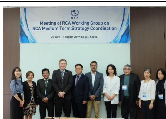
6 th Meeting of the WG on the RCA MTSC July, Korea