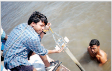
Fig 2. Sampling of sediment with Kajak corer

The project has clearly demonstrated that nuclear analytic techniques are highly effective tools in assisting in a deeper understanding the impact of a tsunami on coastal and marine environments and the subsequent mitigation efforts that can be undertaken. These techniques have been shown to be applicable not only to the study of the impact of the tsunami but also to other natural disasters such as storm surges and typhoons affecting coastal areas. Additionally the nuclear techniques applied in this project have a great potential for use in studies of sea warming and sea level rise that are predicted as a consequence of changing climate and global warming.