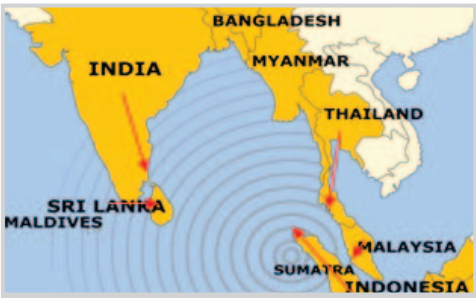
Fig. 1 Locations sampling sites in the affected countries

The project was implemented with a series of activities shown on the left. The technical investigations included: analysis in the sediments from core samples; assessment of the groundwater system in tsunami-affected areas; a limited study of the uptake of trace elements in coral and in a mollusc; and, a whole-of-ecosystem ecological risk analysis.