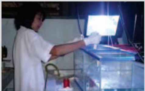
Fig 3. Radiotracer experiment