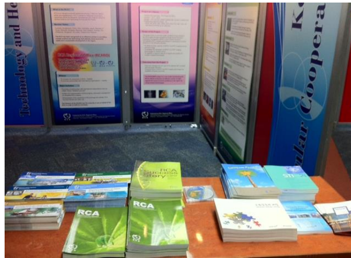
(RCARO's Booth at the UNDP-SU-SSC/ESCAP Exhibition)