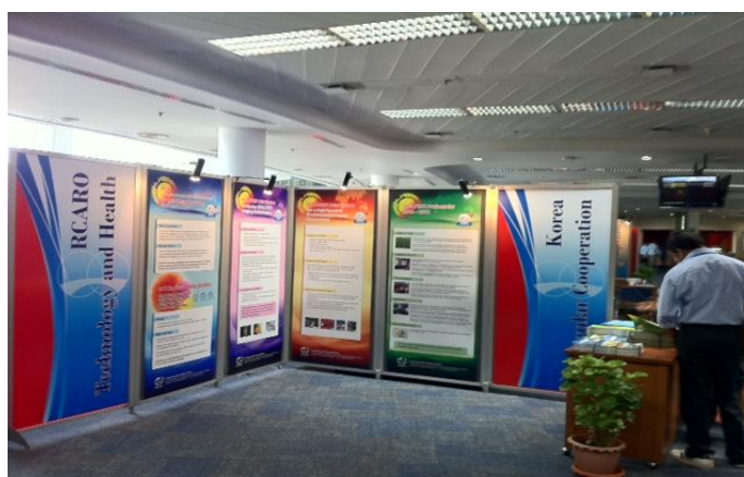
(RCARO's Booth at the UNDP-SU-SSC/ESCAP Exhibition)

In response to the request of UNDP, RCARO participated in the exhibition as one of the successful projects being implemented in cooperation with UNDP-SU/SSC. RCARO set up 4 panels elaborating RCA, RCA projects, RCA/UNDP project and RCARO at the booth. RCARO also distributed RCA brochures and Success Stories to participants. It was a great opportunity to promote RCA and its activities to the experts in nuclear science and technology and related stakeholders of UNDP. Due to the duplicated period of the UNDP-SU-SSC/ESCAP Exhibition with RCA/UNDP Project Kick-Off Meeting, staff of RCARO was not able to attend the exhibition.