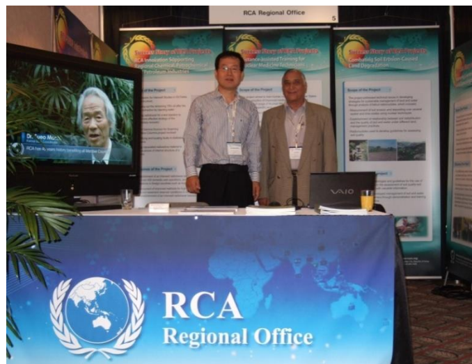
(Visit of Former National RCA Representative of India)