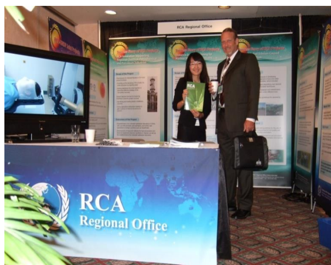
(RCARO's Promotion Activity to a visitor)