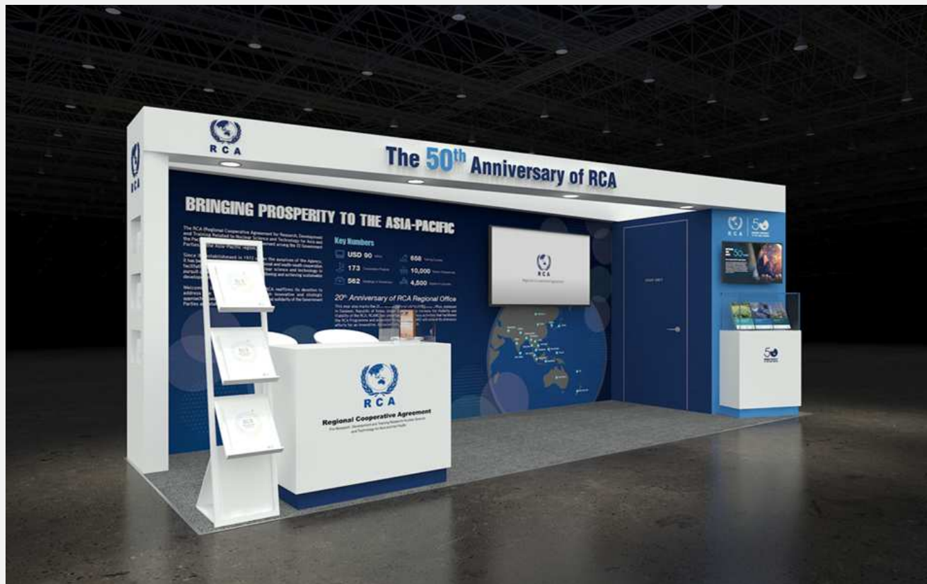
Design Sketch from the Special Exhibition during the 50 th Anniversary of the RCA