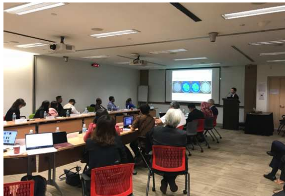
Final Review Meeting (2018, SIN)