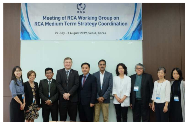
Meeting of RCA WG on MTSC (Jul. 2019 ROK)