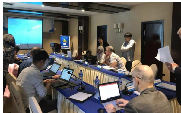
Research Coordination Meeting (Jun. 2019, MON)