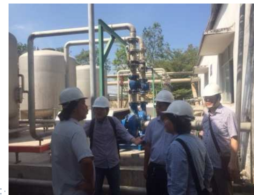
Expert Mission 2019 (VIE)