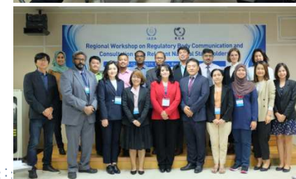
IAEA/RCA Workshop 2019 (ROK)