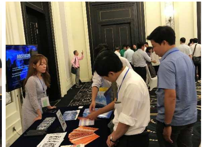
Promoting RCA at APFSD 2019 (THA) and VINANST-13 (VIE)