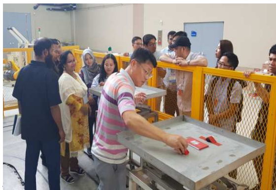
RTC 2019 (ROK)