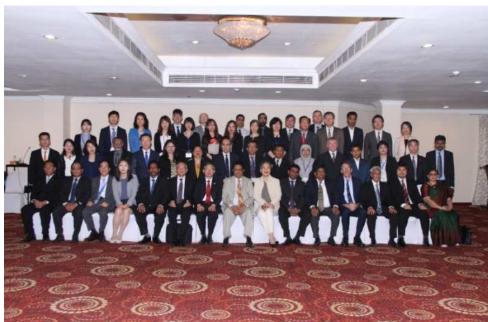
41st RCA NRM (Mar. 2019, SRL)