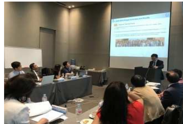
Expert Meeting (Apr. 2019, ROK)