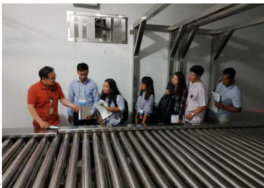
RTC 2019 (ROK)