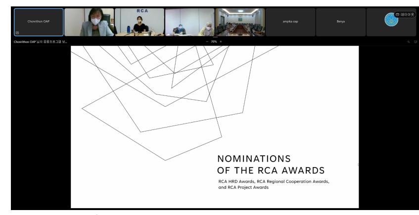
Virtual meeting of the RCA Awards Committee

In commemoration of the strong commitment and work done by all the contributors, it was decided to present the RCA Awards to the experts, organizations and parties identified based on specified categories. The RCA Awards consists of i) Governance Awards for those who have been devoted to the good governance of the RCA, ii) Project