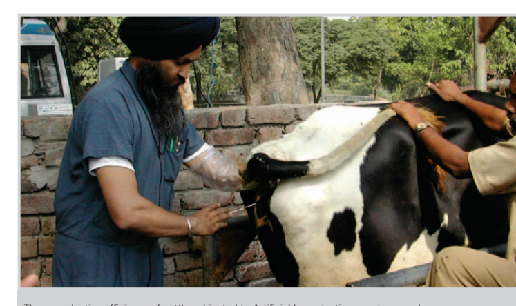
The reproductive efficiency of cattle subjected to Artificial Insemination was improved with diagnostic support using radioimmunoassay (RIA) technology for measuring progesterone.

Through the RCA project implemented from 1999 to 2004, participants