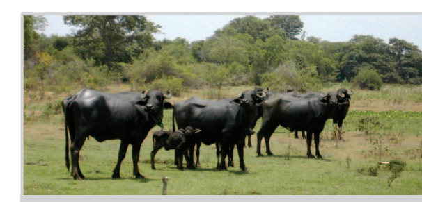
(Cross-bred buffaloes): A group of cross-bred buffaloes in Sri Lanka, produced through AI on indigenous cows using semen from improved Murrah bulls.

Almost all the participating Member States achieved genetic improvement in their livestock through different reproductive techniques. For example, India and Sri Lanka achieved this through the use of synchronization programmes, insemination with genetically superior semen and embryo transfer (ET); while Bangladesh used in-vitro fertilization (IVF) and ET programmes; and Myanmar, the Philippines, Indonesia and Thailand used cross-breeding programmes.