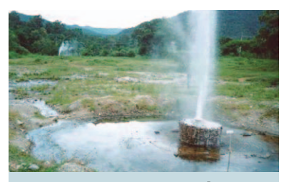
Hot springs in Mae Hong Son area, Thailand, Hot springs in Mae Hong Son area. Thailand