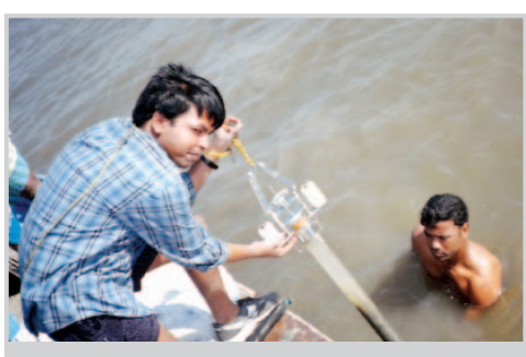
Fig. 2 Sampling of sediment with Kajak corer

Already the Water Resource Board of Sri Lanka has proposed a national project on the "Trends in Water Quality Deterioration of Northwestern Limestone Aquifer System of the Puttalam District of Sri Lanka". It will apply results and information from the implementation of the tsunami project to the management of ground water resources. Similarly, through participation in the project, Pakistan and other countries which are